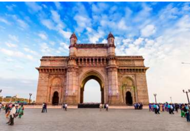
Gateway of India